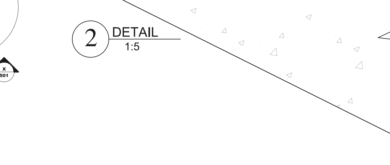
LIFT C O O C F O